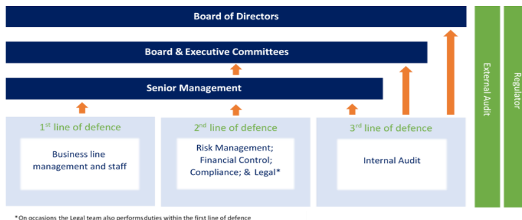
Figure 1: Three Lines of Defence Model

In the three lines of defence model, business line management is the first line of defence (including those functions that are responsible for day-to-day operations and treasury function), the various risk control and compliance oversight functions established by management represent the second line of defence, and independent audit is the third.